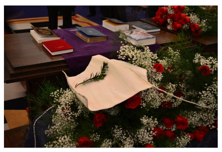
The altar with the books of scripture, roses, apron and sprig of Acacia