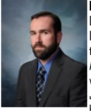
Euclid Chapter No. 13, Royal Arch Masons